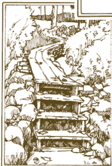
Steps and boardwalk